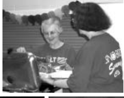
Who says the workers don't have fun!