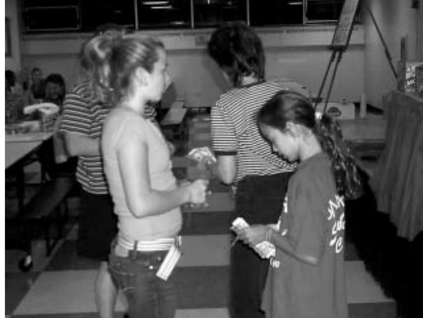
Raffle ticket helpers - boy are they loaded (with CASH!)