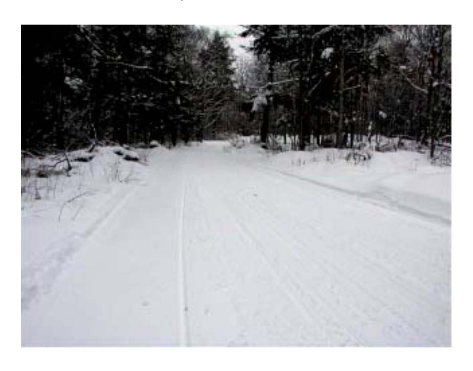
Safety Class, January 2006