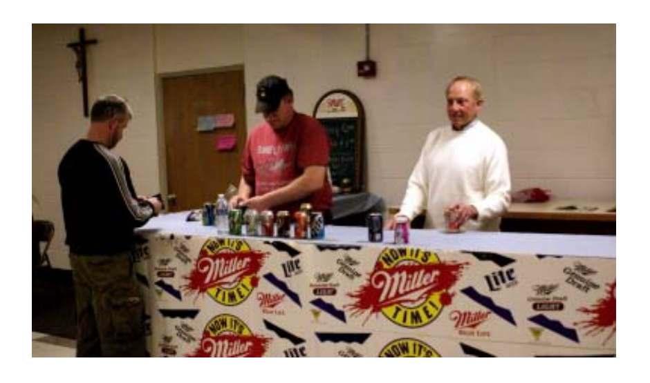
44th Annual Smelt Fry