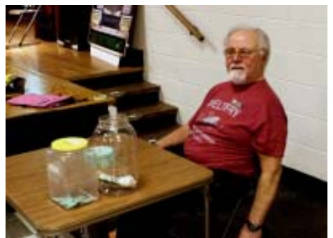
April 19th 2013